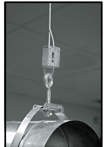
Spiral Buckle with eye bolt and the Dyna-Tite Wire Rope Suspension System