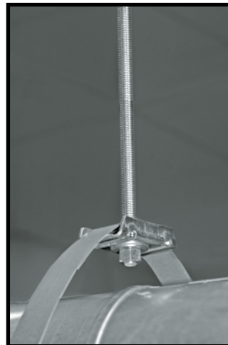
Spiral Buckle with threaded rod