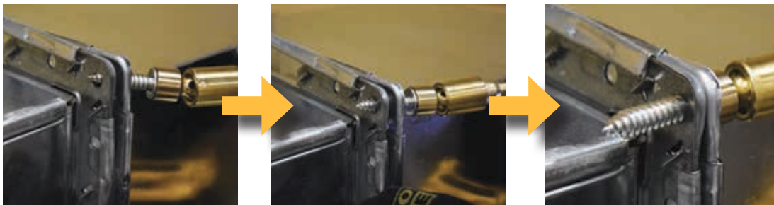
Self-piloting screw tip of the bolt self-aligns the corners and ductwork, eliminating the need for an alignment tool and clamping. 1-1/2" bolt shown.

Patent Pending and Patent Nos 6,810,570; 8,172,280; and 8,474,881