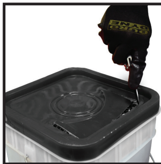
Easy cut lid