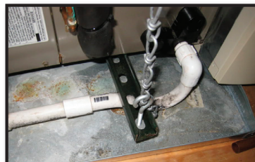
Applications: Industrial Mechanical Residential Commercial Electrical