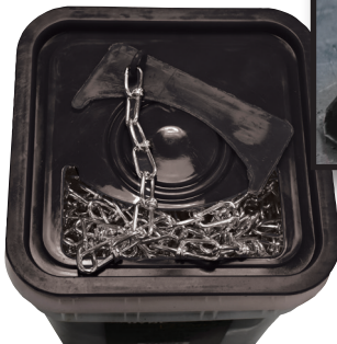
Loop inside lid keeps end of chain from getting lost