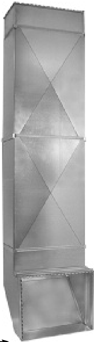
No. 1073 ADJ. PLENUM SIDE