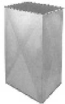
No. 1075 'B' STYLE PLENUM