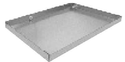
No. 137 DRAIN PAN

Complete package consisting of: 1 - Starting Collar 2 - 30" Duct Sections 1 - R.A. Plenum with 1" Filter Rack 6 - 10" Drive Straps Shipped K.D. in One Carton